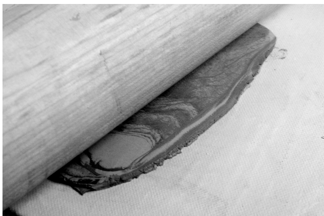
Roll flat again