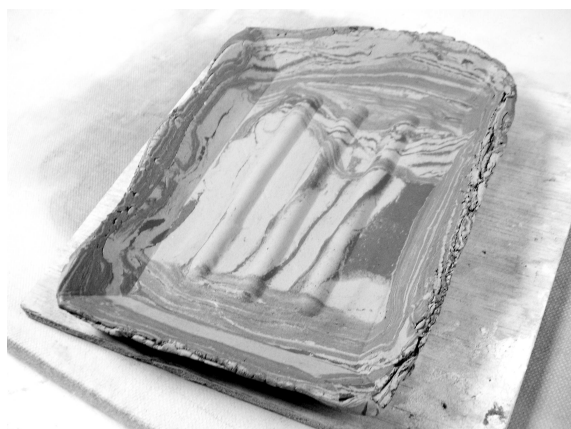
Finished slab (shaped by a press mold)