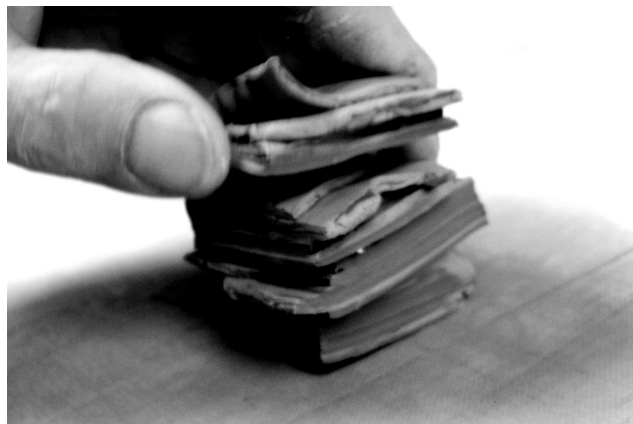
Stack cut pieces