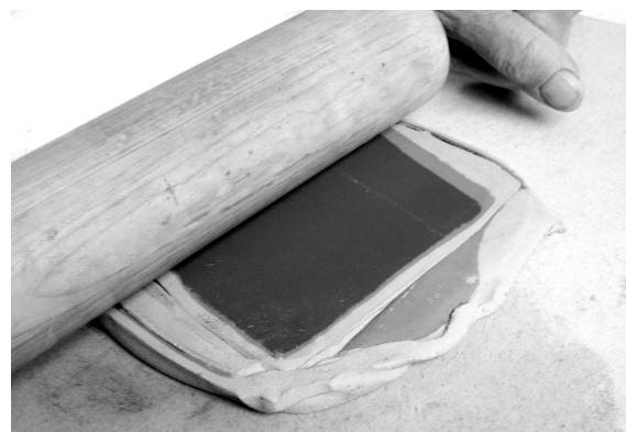
Turn over, roll on front side