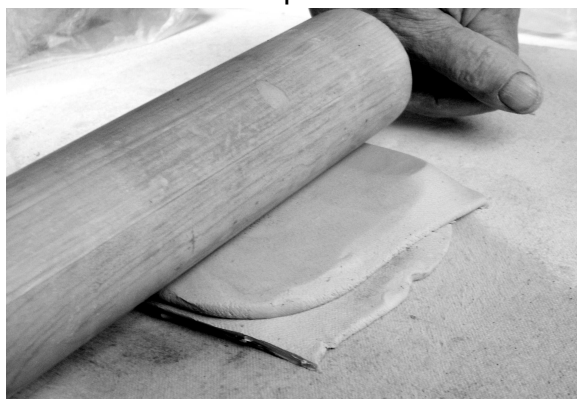
Turn over, roll on back side