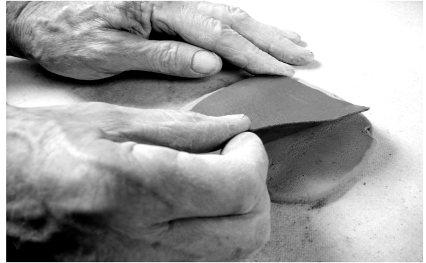
Attach smallest to medium