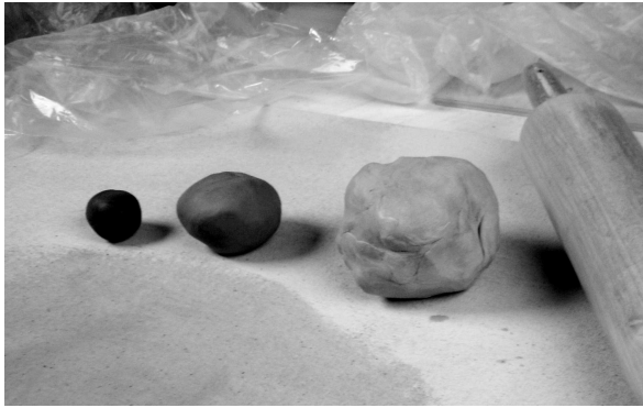
Clay ratio 1/4/16