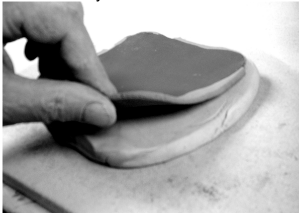
Attach combined sm./med. to large